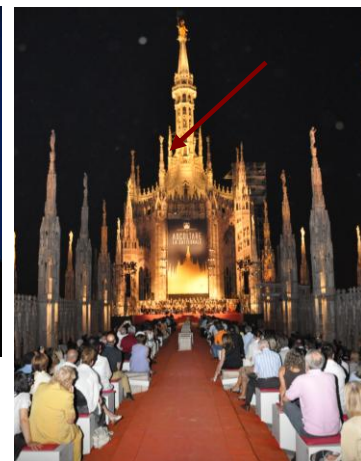
Duomo’s terrace, the concerts among the pinnacles, on the roof of the city G. Verdi “Four Sacred Pieces”

The excellent outcome of this project is a stepping stone in a broader project meant to contribute to the rebirth of the most significant and most important places of cult, to render them valuable, and at the same time offer the audience a vivid and involving experience.